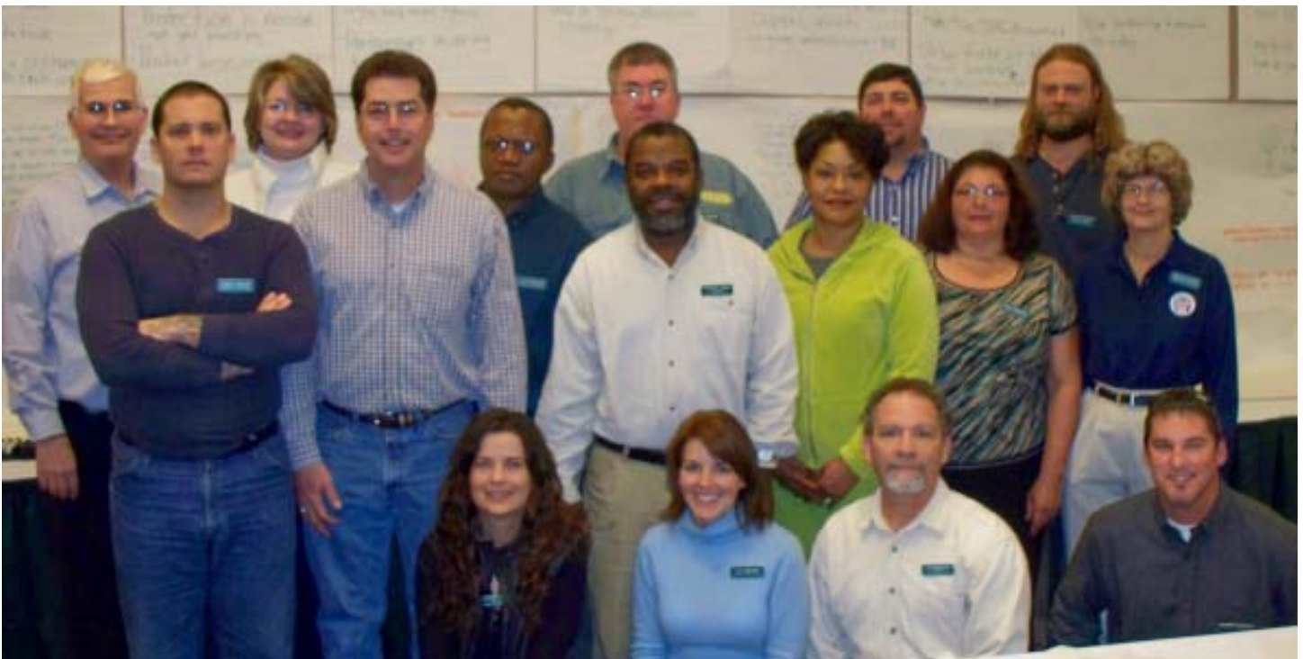
TUFUC Board and Staff at the 2010 Planning Retreat