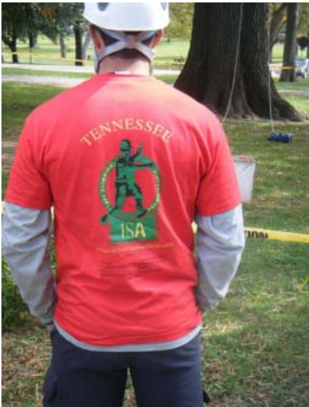
Tennessee Urban Forestry Council's 11th Annual Tree Climbing Championship T-Shirt