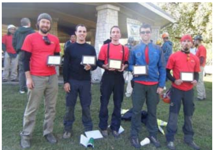
Tree Climbing Championship Preliminary Winners