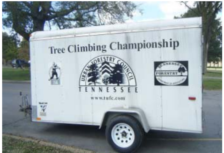
The Tree Climbing Championship's supply trailer