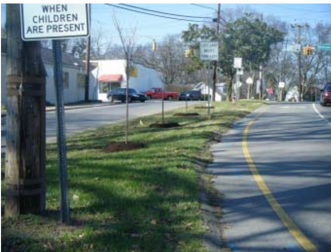
Over 250 volunteers planted 121 powerline-approved trees in Nashville's Inglewood neighborhood during the 8th annual ReLeafing Day sponsored by the Nashville Tree Foundation. NES, one of the sponsors of the annual project, provided 1.5-caliper trees, mulch, and soil amendments. Project Blue Streams of the Cumberland River Compact also donated trees. Beard Landscaping watered each tree that was planted.