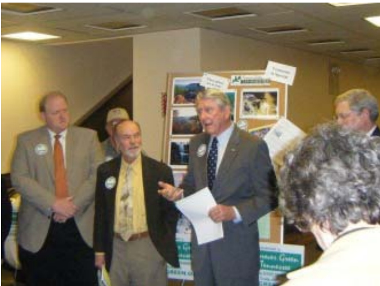
Governor Winfield Dunn address the Forever Green press conference at the Legislative Plaza of the State Capitol as part of the Sustainable Educational Day. The TUFCC hosted an educational booth at this event.