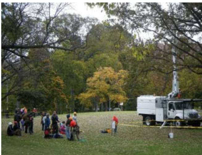
The 11th Tennessee Tree Climbing Championship at Centennial Park in Nashville