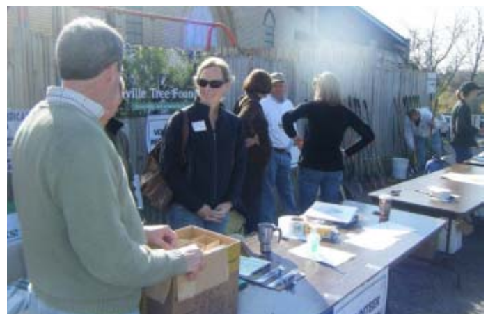
Sign-in station for the Nashville Tree Foundation annual tree planting event.