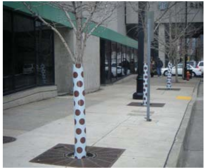
Trees were dressed up for a downtown Nashville event.