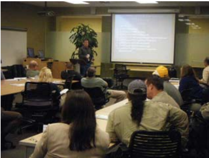
Pre-conference Arborist Workshop organized by Zack French.