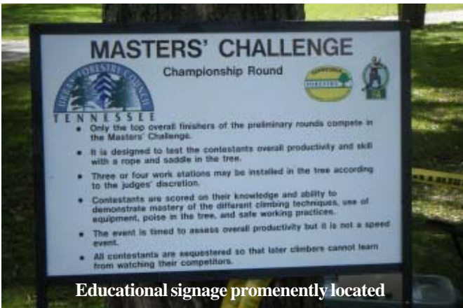
Educational signage prominently located