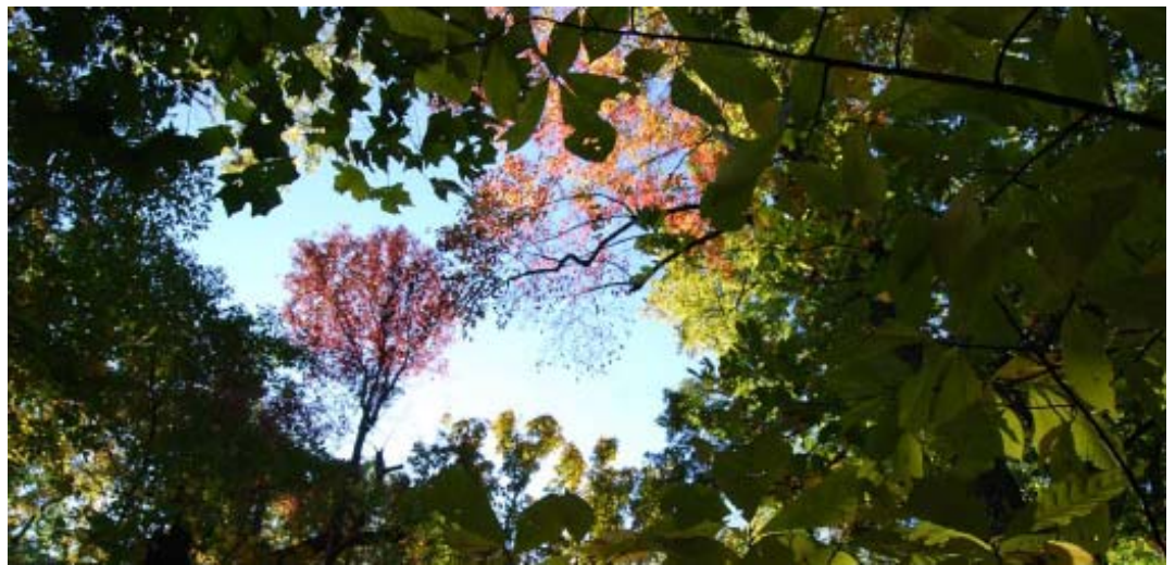
Black Gum Rising Above, Sporting Fall Color