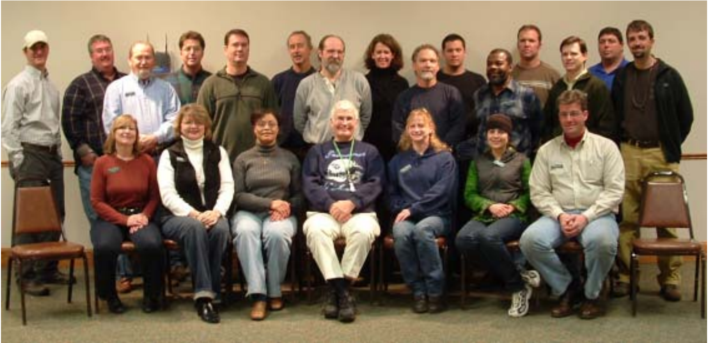
The Annual Board Planning retreat was held at the Pin Oak Lodge