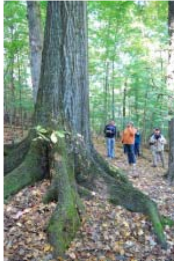
Northern Red Oak